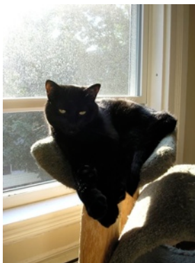
Elvis Graves, enjoying the sunlight.