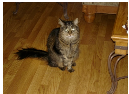
Sully Welshman waiting patiently.