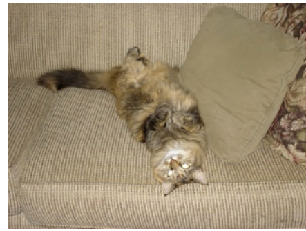
Belle Welshman posing for the camera!